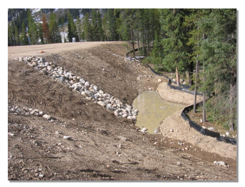
Photograph SB-1. Sediment basin at the toe of a slope.

Most large construction sites (typically greater than 2 acres) will require one or more sediment basins for effective